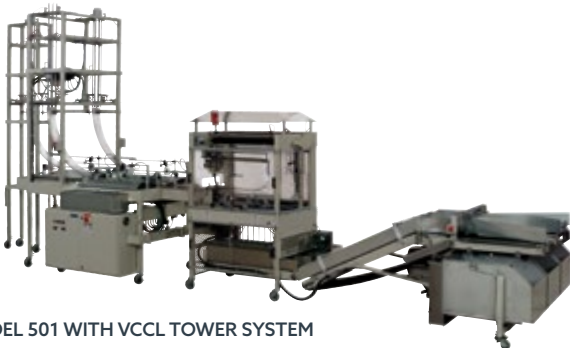
MODEL 501 WITH VCCL TOWER SYSTEM

Available in a one to four lane design. The tower system counts, accumulates and transfers the stack of cups to the packager. Lane integrity is a feature available to track infeed lanes to specific outfeed areas.