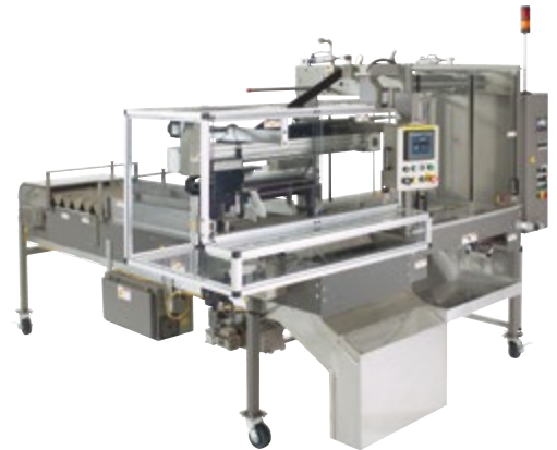
MODEL 501 WITH INDEXING INFEED