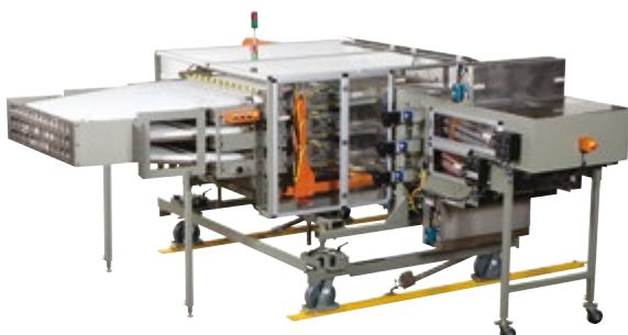
TRIM PRESS INTERFACE

Can accommodate 1, 2 or 3 tier configurations. With state of the art modular manufacturing, multiple product sizes can be run with minimal change over time.