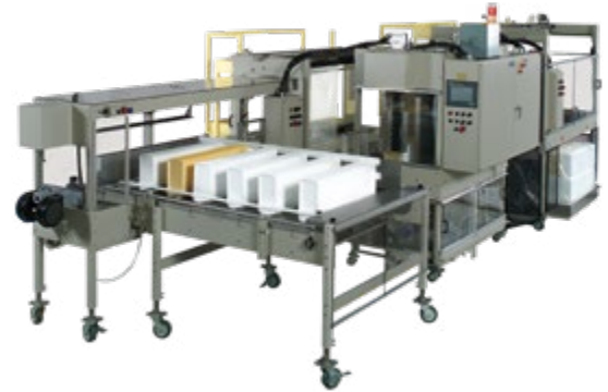
MODEL 501 WITH TRAY INFEED SYSTEM

Compared to other types of packaging systems, Rennco vertical packaging equipment occupies minimal floor space. Also provided to customers is innovative packaging solutions through dedication to quality, utilizing advanced technology, and continuous improvement.