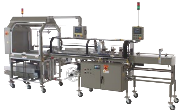
MODEL VOYAGER WITH CCL SYSTEM

Handles nested cups in a single stream. The cups are counted by means of optical sensors. The stacks are then transferred to a Rennco packager. Multiple lanes can be combined to feed a single packager based on upstream production speeds.