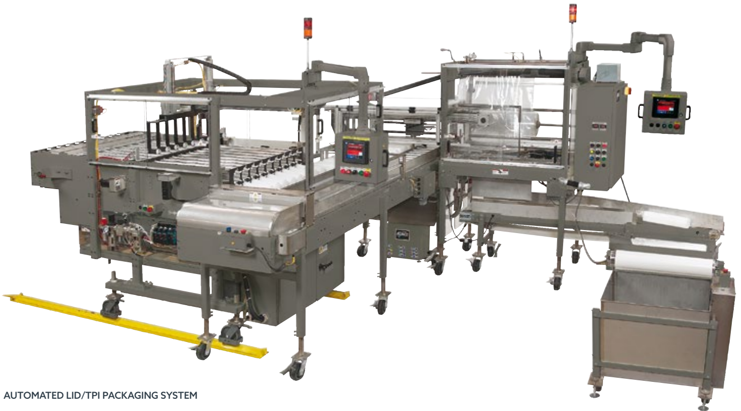
AUTOMATED LID/TPI PACKAGING SYSTEM

The TPI unit can be configured so products from a mixed mold bed can be handled and tracked from the trim press all the way through to the discharge of the Rennco bagging system. If complete automation is not required, a simple hand load infeed conveyor system can be utilized for cost savings of the bagging operation.