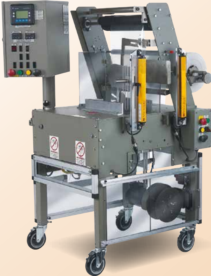
Standard Seal Assembly Horizontal Seal Above Vertical Seal