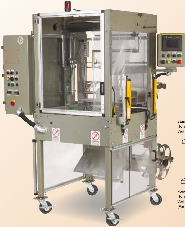
Standard Seal Assembly Horizontal Seal Above Vertical Seal